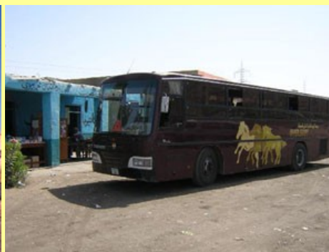
Luxury coaches to take you on excursions.

Whatever it is you want from a holiday it can be found in and around Hurghada: