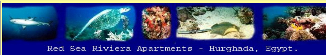
Red Sea Riviera Apartments - Hurghada, Egypt.

Islands near Hurghada offer all kinds of fun and excitement. Take a day trip to Giftun Island for snorkeling and a fish barbecue, or view the Red Sea from a submarine! When you're not in the sea you can shop in the boutiques, relax in the luxury holiday villages or visit the Roman Mons Porphyrites (mountain of porphyry) remains at nearby Gebel Abu Dukhan (Father of Smoke). Day-trips or safaris to explore the Red Sea Mountains by camel or jeep are also available. Other nearby islands and destinations include the Shadwan Island (Diving, snorkeling, fishing but no swimming), Shaab Abu Shibban (Diving, snorkeling and swimming), Shaab el-Erg (Diving, fishing and snorkeling), Umm Gammar Island (Diving and snorkeling), Shasb Saghir Umm Gammae (Diving), Careless Reef (Diving), Abu Ramada Island (Diving), Shaab Abu Ramada (Fishing), Dishet el-Dhaba (Beaches and swimming), Shaab Abu Hashish (Beaches, diving, snorkeling, swimming and fishing), Sharm el-Arab (Diving, swimming and fishing and Abu Minqar Island (Beaches and swimming).